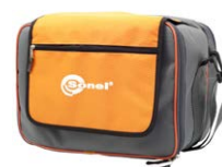
L4 carrying case