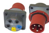
Three-phase socket adapter 63 A