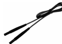
Test lead 0.7 m (banana plugs) black