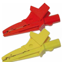
Crocodile clip 1 kV 20 A red / yellow