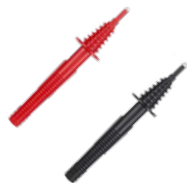
Pin probe 5 kV (banana socket) red / black