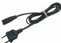
Mains power cable Euro 2-pin plug / IEC C7 plug