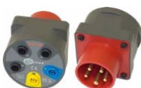
Three-phase socket adapter 16A / 32A