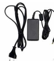
Z7 Power supply adapter