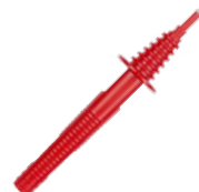
Pin probe 11 kV (banana socket) red